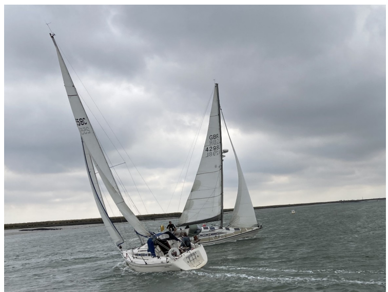
Martinique and Momo 3 in the Roach Plate