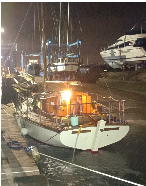
Pumping all night: HALLOWEEN