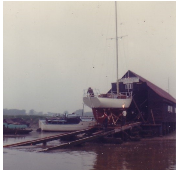
Buchanan fitting out