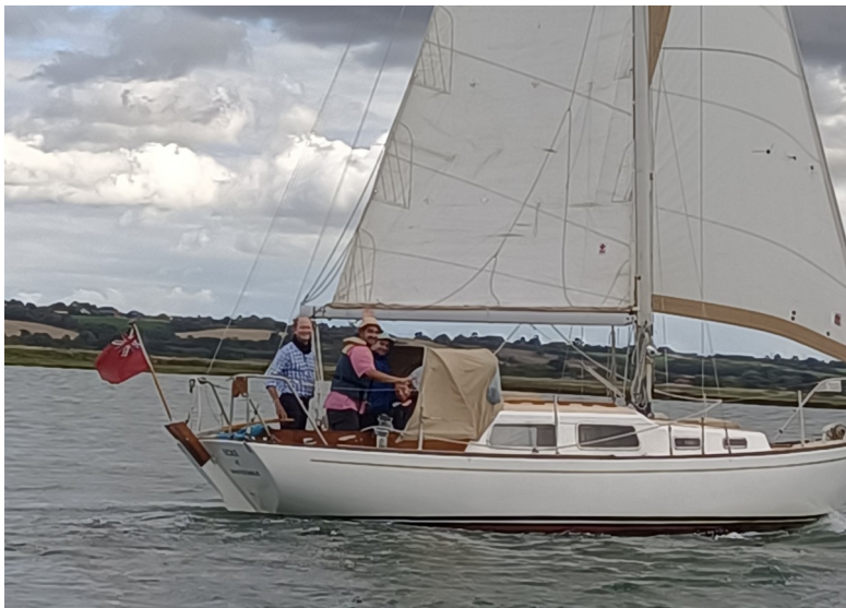
Eole leads the race to the Branklet