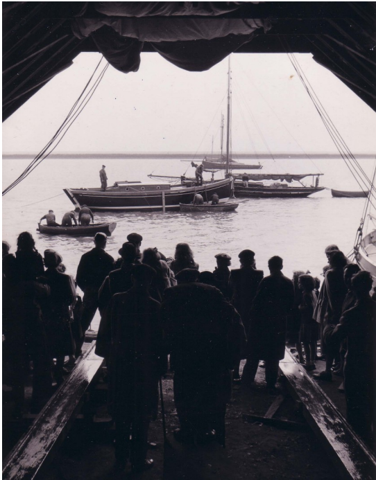
Launch of Lylie, 1951