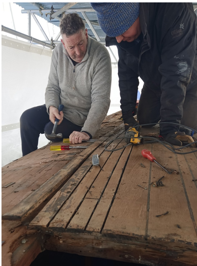
Work on BRIAR ROSE

Finally, I will be calling for the usual assistance with our work boat DALLY in the spring. She urgently needs a new engine box. We can provide the material but anyone with woodworking skills would be welcome to have a go. I will be calling a work party for the usual paint and antifouling.