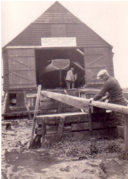
Preparing the ways