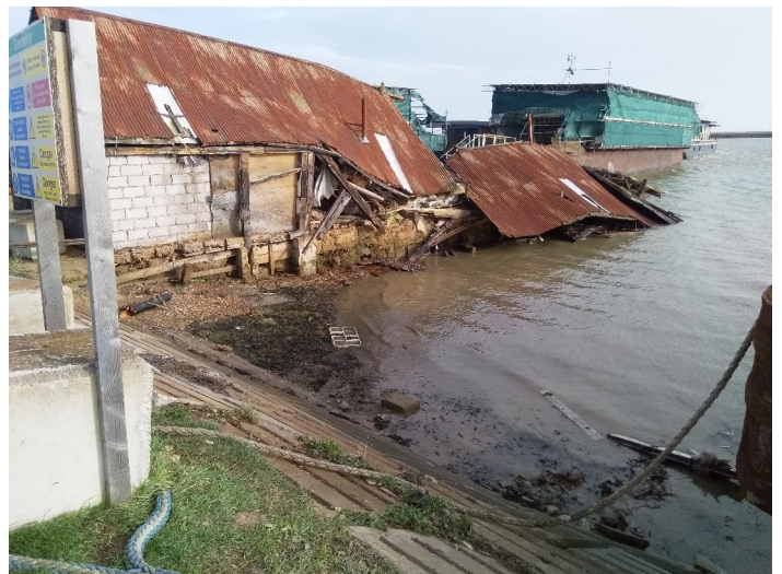
January gales 2024